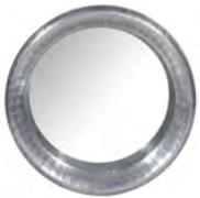
Aviator Cowling Mirror Medium

L: 77.2"/ 196 cm W: 39.8"/ 102 cm H: 29.9"/ 76 cm