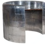
Aviator Cowling Desk

L: 28"/ 71 cm W: 37"/ 94 cm H: 28"/ 71 cm