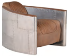
Aviator Tomcat Armchair

L: 28"/ 71 cm W: 37"/ 94 cm H: 28"/ 71 cm