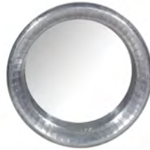
Aviator Cowling Mirror Large