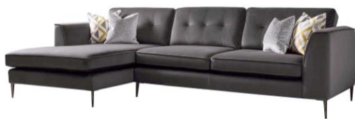
Left Hand Facing Chaise Sofa (Also available as RHF)

Small: W266 x D100/160 x H86cm Large: W310 x D100/160 x H86cm