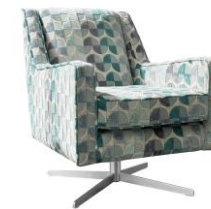
Swivel Chair W70 x D83 x H83cm

Small: W266 x D100/160 x H86cm Large: W310 x D100/160 x H86cm