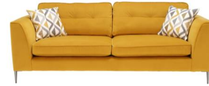
Extra Large Sofa W230 x D100 x H86cm

Regularly plump all cushions to maintain performance. Please refer to the care and commitment leaflet for further details.