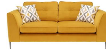
Large Sofa W195 x D100 x H86cm