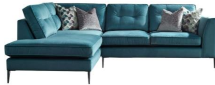
Right Hand Facing Corner Sofa (Also available in LHF)

Small: W266 x D100/160 x H86cm Large: W310 x D100/160 x H86cm