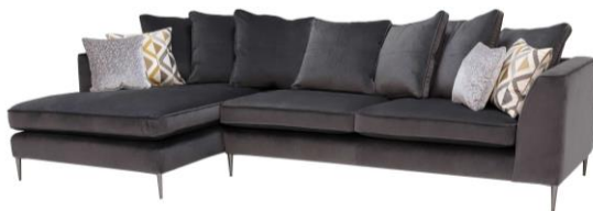
Left Hand Facing Pillow Back Chaise Sofa (Also available as RHF)

Small: W266 x D100/160 x H86cm Large: W310 x D100/160 x H86cm