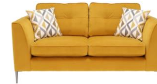
Small Sofa W160 x D100 x H86cm