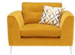
Chair W103 x D100 x H86cm