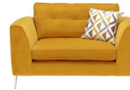
Snuggler W138 x D100 x H86cm

Small: W252 x D205 x H86cm Large: W296 x D205 x H86cm